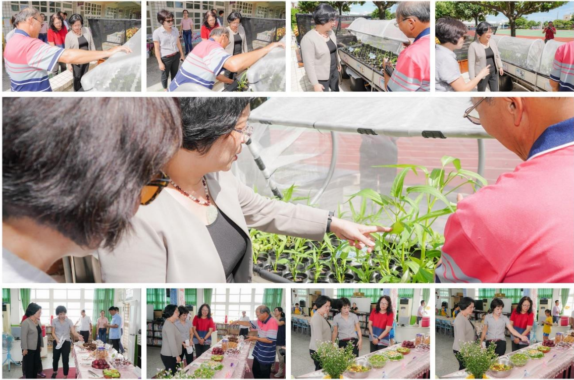
彰化縣縣長王惠美蒞臨本校為孩子說蔬菜超人故事及享用本校綠能生菜美食的活動照片